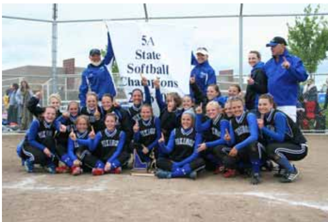
5A State Softball Champions "Back-to-Back"