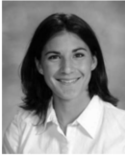
IEL, Idaho & US Regional Girls Soccer "Coach of the Year"