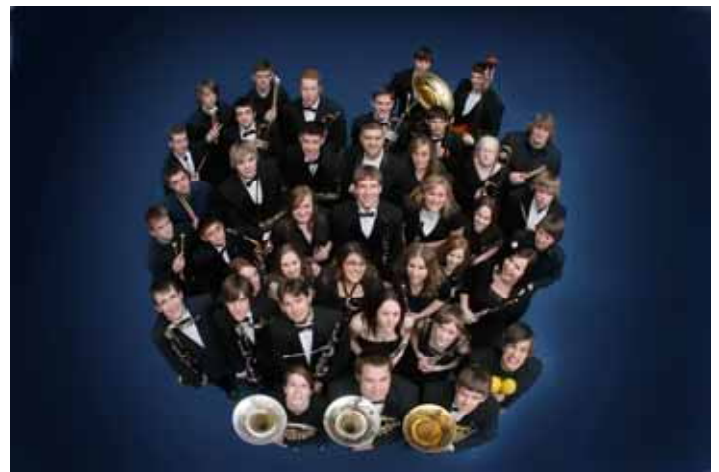
CHS Wind Ensemble They received a Superior Rating at the University of Idaho District I Large Group Festival